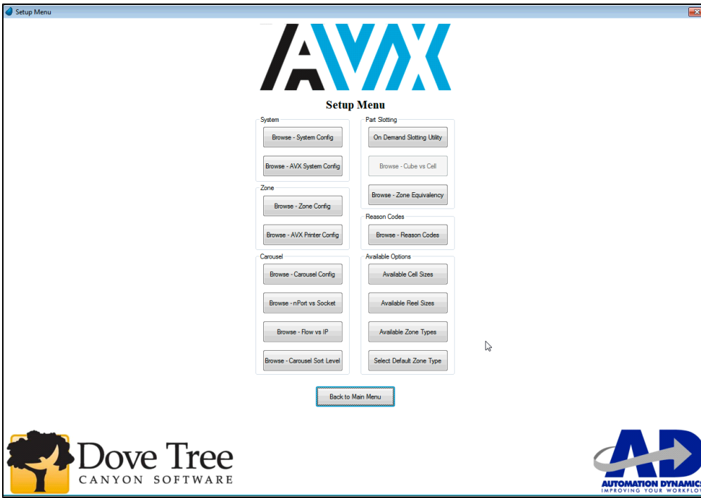
Figure 4-Utilities Splash Screen