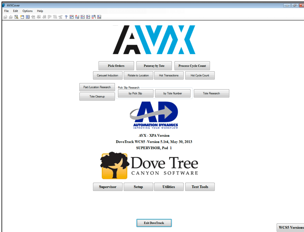
Figure 2-Supervisor Splash Screen